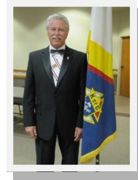
St. Joseph Council 8872 September Calendar